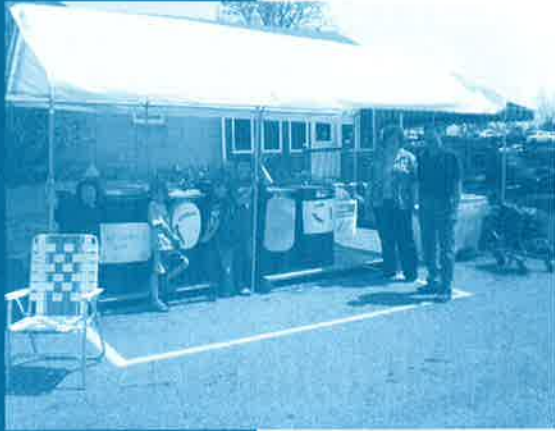
Our hardworking recycling crew!

Last April, Amity Township residents really came through for the environment. Chuck's Auto Salvage on Boyertown Pike sponsored an Earth Day Celebration event to collect automobile waste and recycle it.