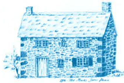
The Mouns Jones House, oldest structure in Berks County.

first 100 race entrants. Awards will be presented to the 1st and 2nd place male and female finishers of the 5K