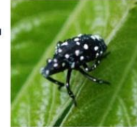
Hatch and 1st Instar: May - June