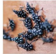
Second Instar: June - July

As we all begin cleaning up our backyards, decks and patios we can't forget to look for Spotted Lanternfly egg masses. Spotted Lanternfly lay eggs on any smooth surface; wood, metal, plastic or rubber. Once you've identified the mass, destroy them by pressing a credit card or something hard against the egg mass until you hear the eggs pop. Egg masses can also be destroyed by scraping them from the surface into a baggie with a few ounces of rubbing alcohol or hand sanitizer. The eggs must be submersed in the liquid in order to be destroyed. Place the bag in another bag and discard it in the trash. Egg masses not destroyed will surely hatch and return as adult lanternflies to ruin your peaceful time outdoors.