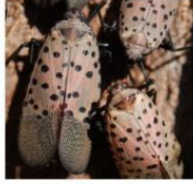
Adults: July - December