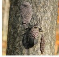
Egg Laying: September - November