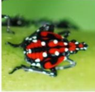
Fourth Instar: July - September