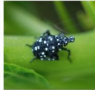
Third Instar: June - July