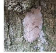
Eggs: October - June