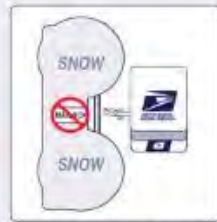
Insufficient Snow Removal