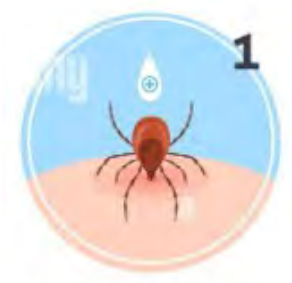
DISINFECT THE BITE AREA